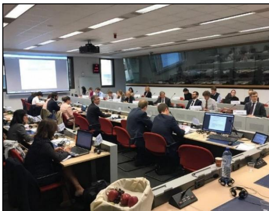
ECN Plenary meeting in Brussels

ECN plenary meetings were held in Brussels on 13 March and 23 October 2018.